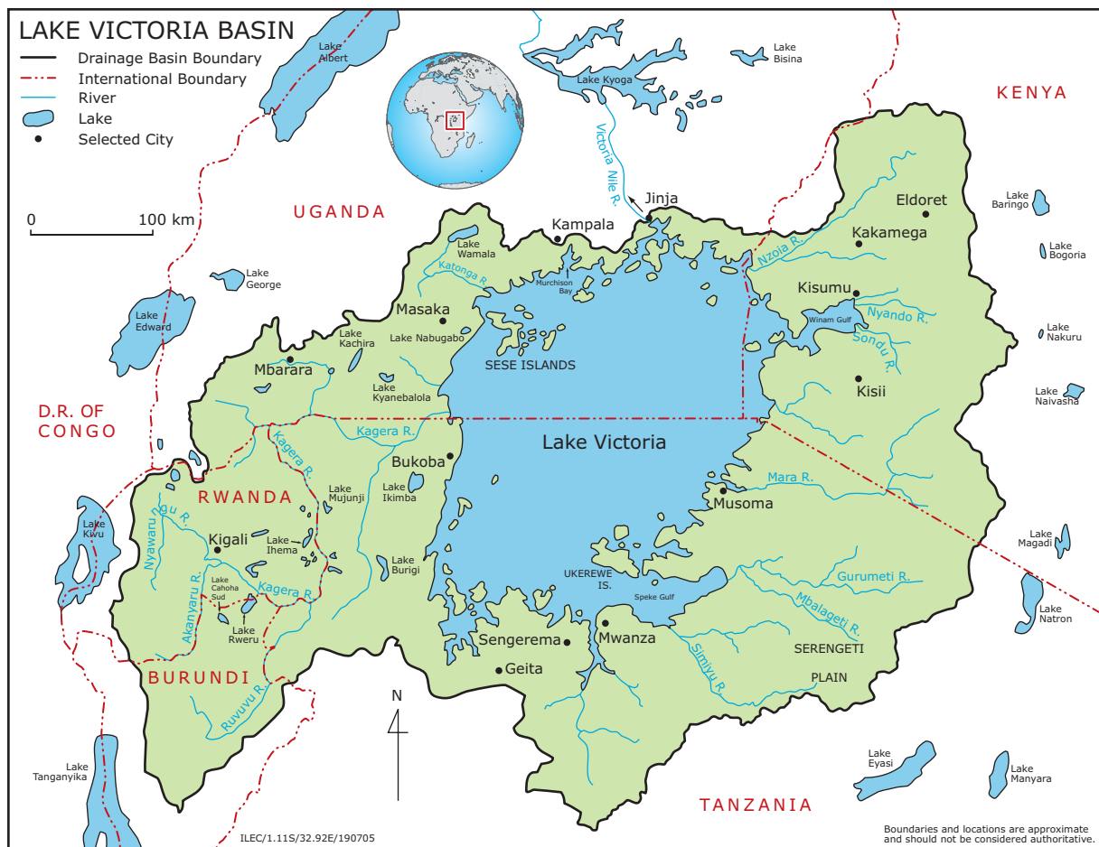
Figure 1. The Lake Victoria Basin.

Domestic and industrial wastewater, solid wastes, sediments from soil erosion in the catchment area, agricultural wastes and atmospheric deposition are the major nutrient sources to the lake. Parts of Lake Victoria, especially the deeper areas, are now considered dead zones, unable to sustain life due to oxygen deficiency in the water. The threats facing the lake have caused considerable hardship for the populations dependent on it for their livelihoods, and also have reduced the biodiversity of the lake's fauna, most notably the phytoplankton and fish.